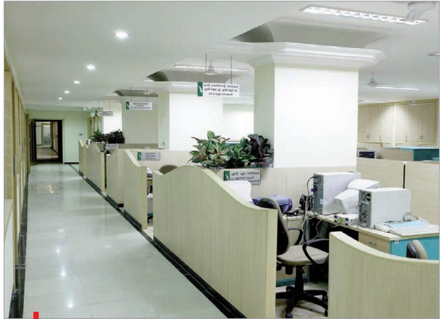
Renovated Collectorate DC*Suite Services site

NIC, Palakkad District Centre was established in 1988 and ever since the centre has developed and implemented at various IT projects in the district to improve the functioning of district administration and delivery of government services to the citizens.