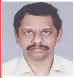
Sri. K S Srinivas IAS, Secretary (IT), Kerala

"Palakkad District has achieved greater dimensions in ICT implementations and online delivery of citizen services through CSCs ,Panchayats and Village Offices by implementing projects like e-District, DC Suite-TalukSuite-VillageSuite, e-Manal etc."